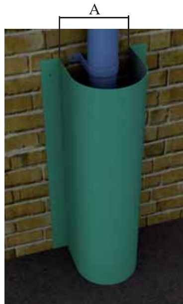
Type 2: Pipe Guard