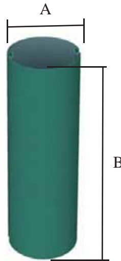
Type 1: Circular